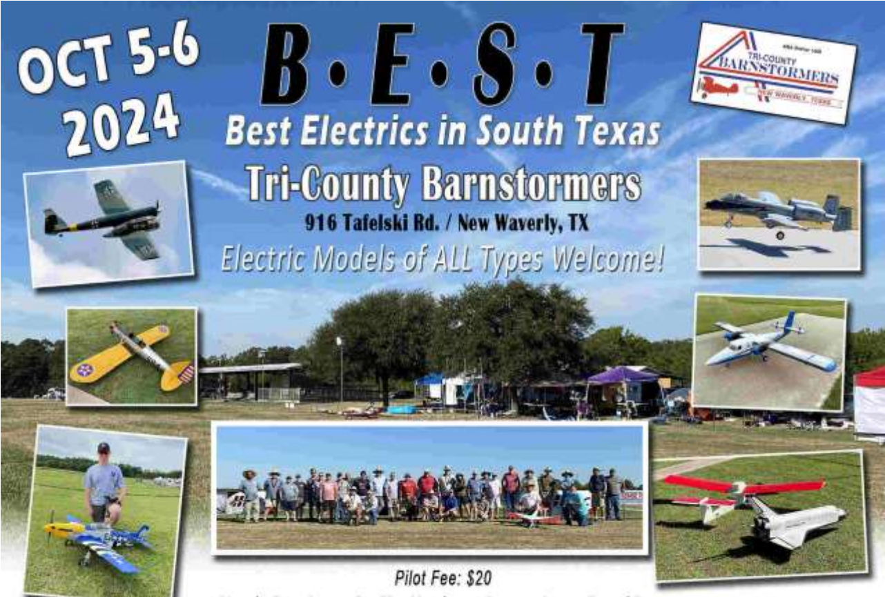
Pilot Fee: $20 Hourly Drawings - On-Site Vendors - Concessions - Paved Runway Electricity for Charging - Covered Pit Area - RV Parking Available (no hookups)